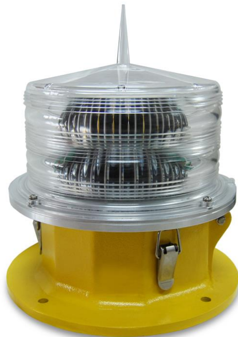
❖ Above: The “WL-20K” White Medium Intensity Aircraft Warning Light

The most important feature of WL-20K is that it works as a dual light. At day time the LED arrays are working and omitting 20,000cd light intensity and at night time using the integrated change-over relay, the LED array will work to omit a light output intensity of 2,000cd.